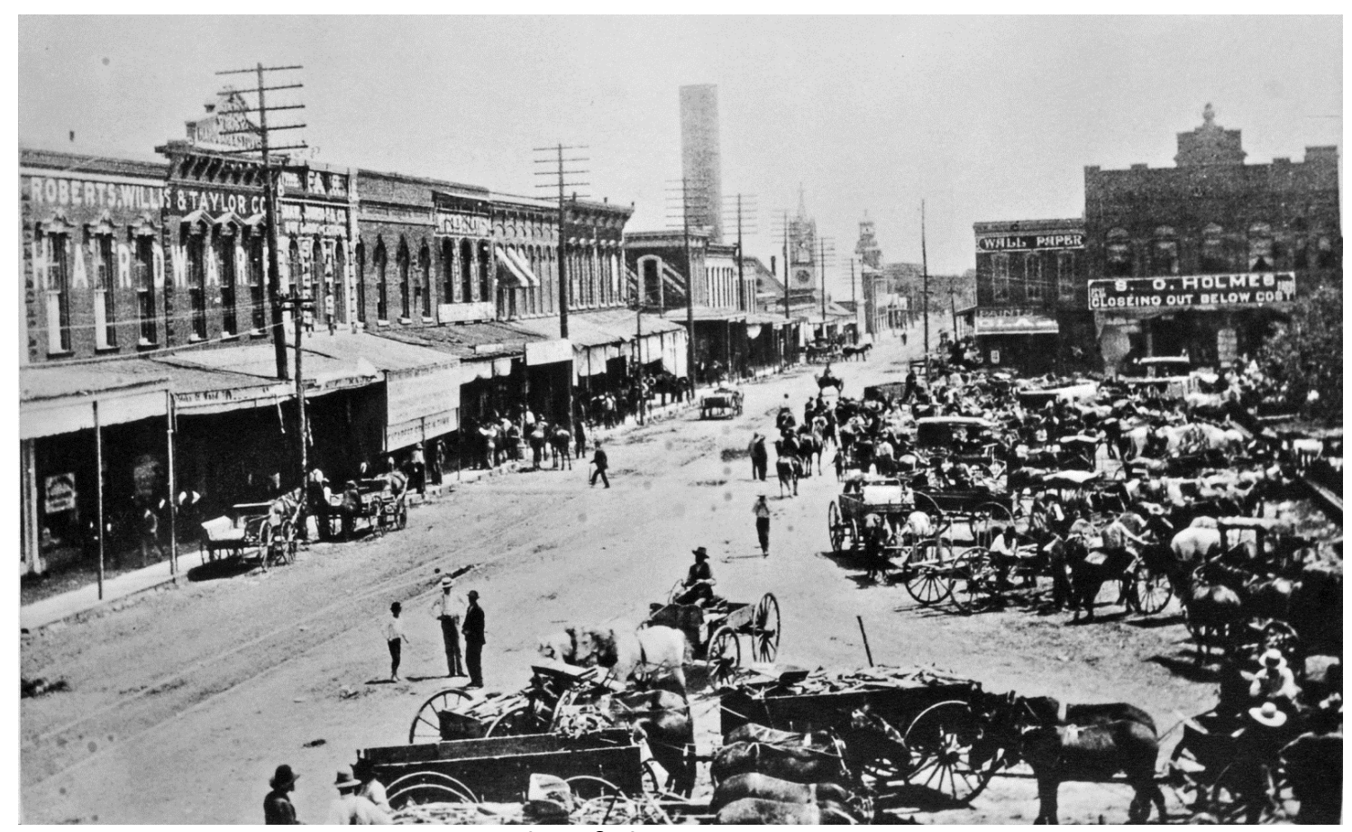
East Side of the Square, 1890

By 1890, Denison was the 8th largest and Sherman was the 10th largest cities in the State of Texas. In 1880 Grayson County's population was higher than any other Texas county and in 1890 it was second only to Dallas County.